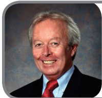
Edward J. Kennedy, Jr.